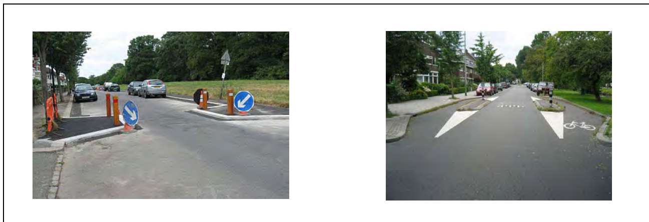
Figure 3: Two road narrowings configured differently

The choker on the left forces cyclists closer to moving vehicles, but the one on the right does not.